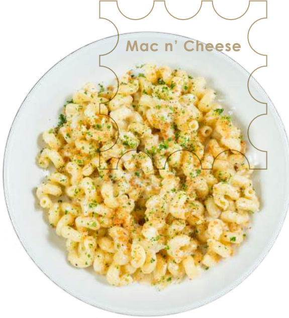
Mac n' Cheese

Hand breaded chicken fingers served with creamy slaw, pasta salad, or house made chips. • 5.99